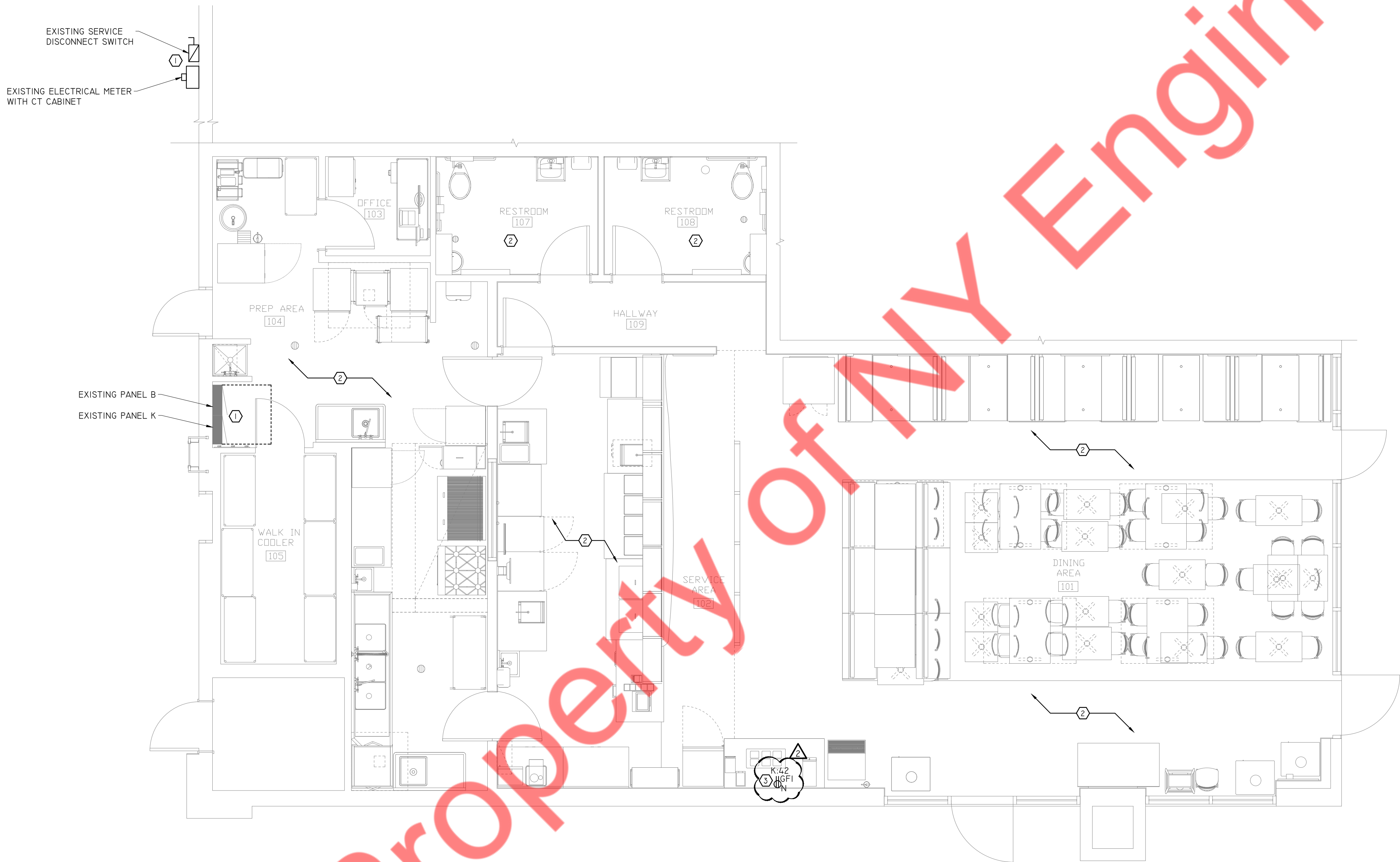
1 ELECTRICAL POWER PLAN SCALE 1/4" = 1'-0"

© ALL DRAWINGS AND WRITTEN MATERIAL CONTAINED HEREIN ARE THE PROPERTY OF THE ARCHITECT. THEY MAY NOT BE REVISED, COPIED, REUSED, OR DISCLOSED IN ANY MANNER WITHOUT WRITTEN AUTHORIZATION FROM THE ARCHITECT.